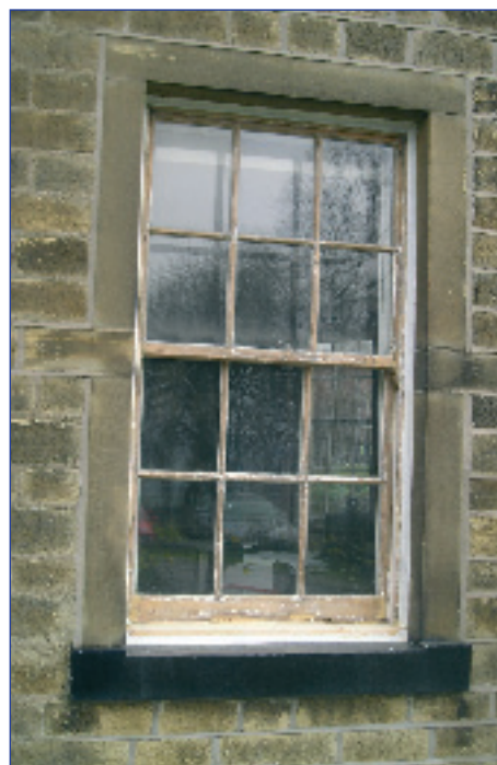
Complete all the repairs on the window.