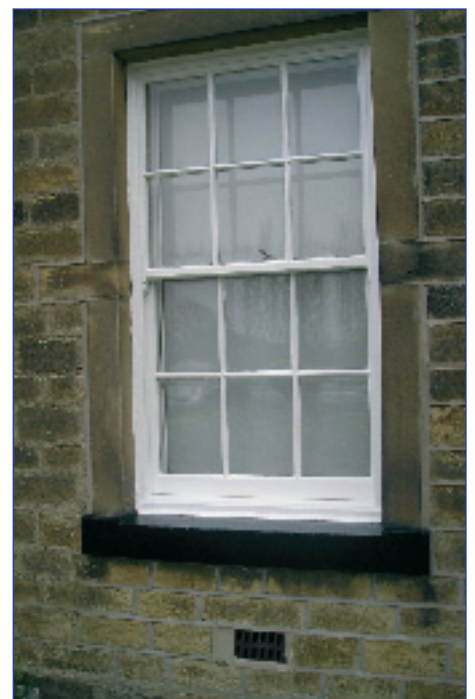
The repaired window is painted.