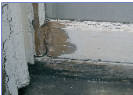
Use the Desowood grinding machine to remove the decay.