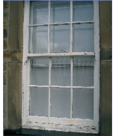
Window affected by wood decay.

The repair is completed with Desowood RAP.