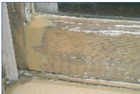
Apply Desowood SAP / RAP to complete the repair.