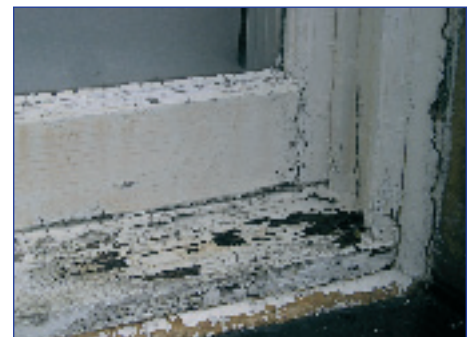
Wood decay at joints and cill require replacement.